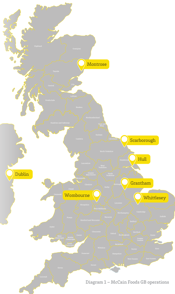
Diagram 1 – McCain Foods GB operations

The supply chain 1 of products and services that contribute to our operations includes raw agricultural materials – the top categories being potato and other commodities, including frying oils and dairy. McCain Foods GB is the largest purchaser of British potatoes and, in FY20, our largest category of spend was on agricultural products and specifically potatoes – procured from 265 contracted growers, while other ingredients and raw materials were sourced from more than 30 suppliers in 12 countries.